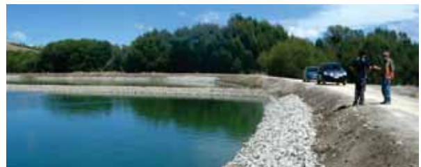
Example of a storage pond