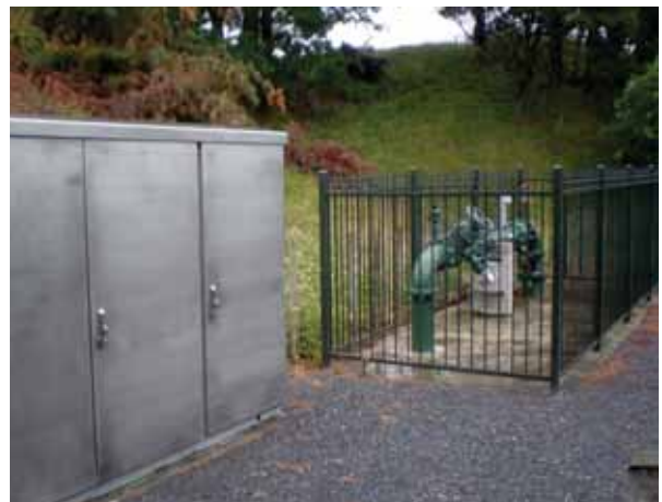
Example of an existing wellhead