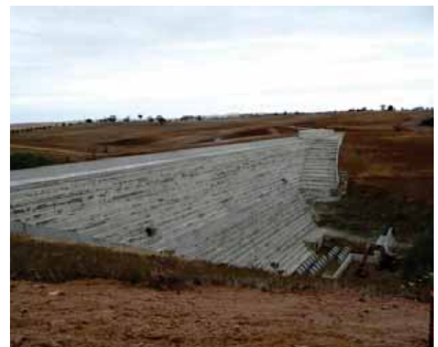
Example of a similar type of dam

This information is based on preliminary concept design only and may change following further investigations and design work.