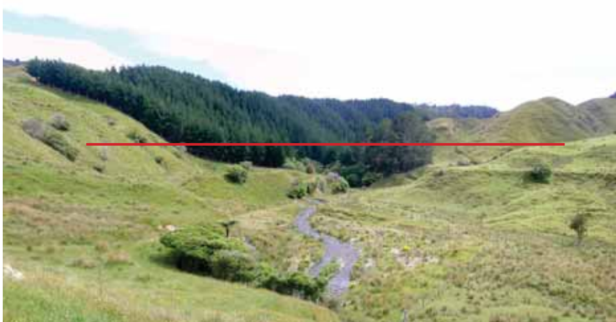
View up valley showing possible dam crest height