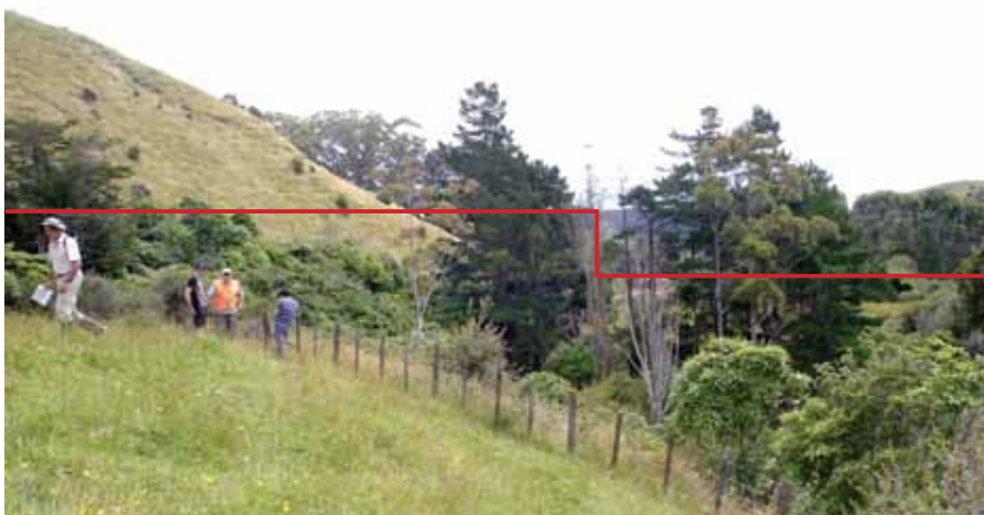
View of valley showing possible dam crest height