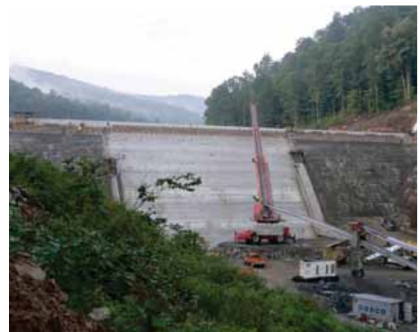
Example of a similar type of dam

This information is based on preliminary concept design only and may change following further investigations and design work.