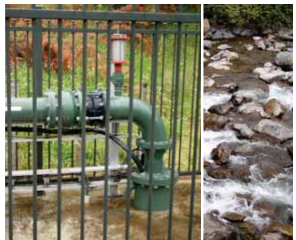
Example of an existing wellhead

This information is based on preliminary concept design only and may change following further investigations and design work.