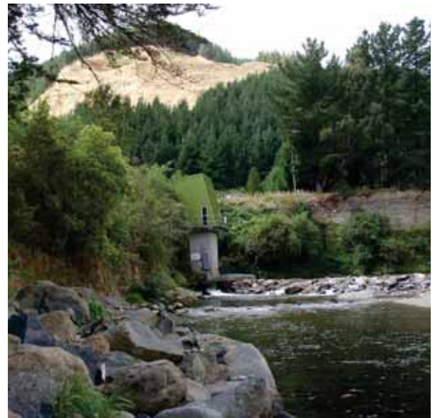
Waikanae water treatment plant river intake