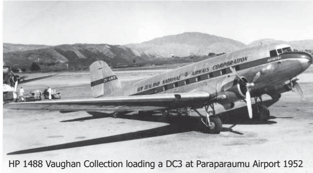
HP 1488 Vaughan Collection loading a DC3 at Paraparaumu Airport 1952

The Museum's primary task is to preserve and display as much as possible of local aviation history. An extensive collection is held of models and pictorial images, together with an aviation library which includes DVD's, VCR's and many historic aviation publications. Paraparaumu Airport was the hub of commercial aviation in New Zealand from 1947 to 1959 until operations shifted to the reconstructed Rongotai which we now know as Wellington Airport. The history of the major operators, National Airways Corporation (NAC) and Safe Air who used Paraparaumu Airport throughout this period, is well displayed at the Museum.