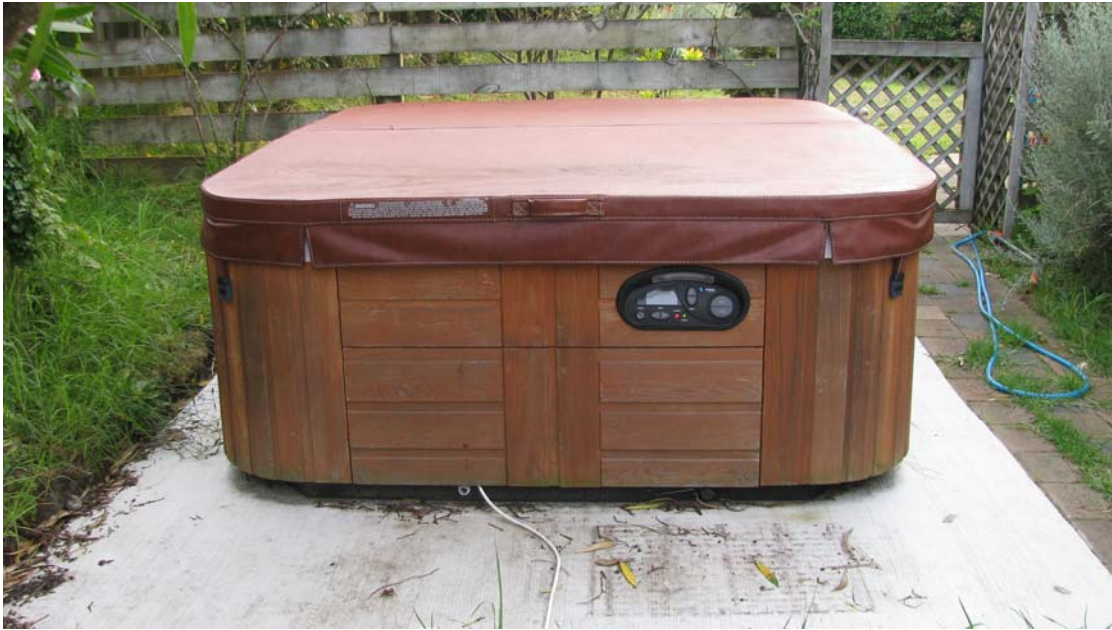
Portable Spa Pool - 760mm above ground level