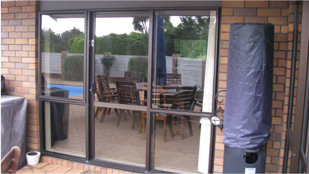
Sliding Door 2