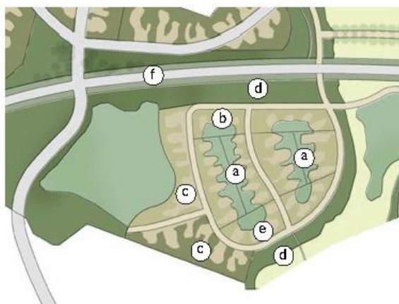
Mai Mai Description Plan Scale 1:5000@A4