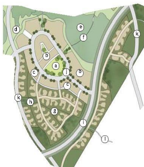
Ti Kouka Description Plan Scale 1:5000@A4

Note: This plan is indicative only. The final layout will be determined at the Neighbourhood Development Stage