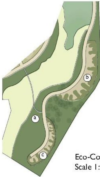
Eco-Commercial Description Plan Scale 1:5000@A4