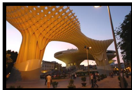
High design quality for public spaces