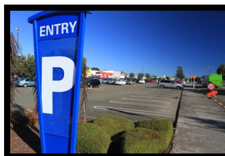
Clearly marked entrance