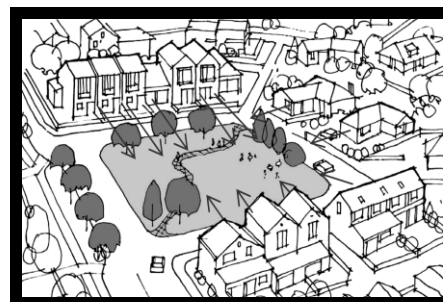
Design supports surveillance onto streets and other public space