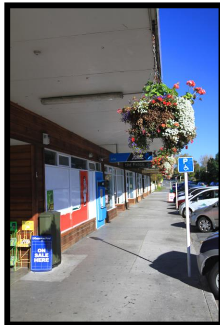
Active frontage and simple landscaping can delineate ownership and instil sense of place