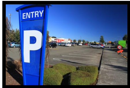
Clearly marked entrance