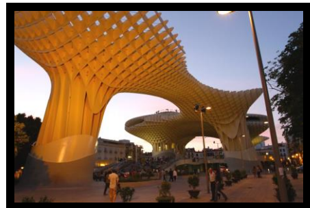
High design quality for public spaces