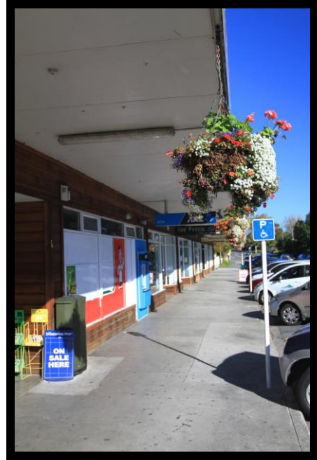
Active frontage and simple landscaping can delineate ownership and instil sense of place