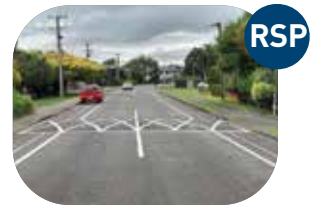
Construct Hump/ platform