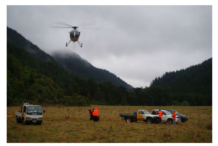
Helicopter moves drilling equipment for geotechnical testing

Investigations are continuing for the Lower Maungakotukutuku dam ($25.1 million), Aquifer storage and recovery ($22.6 million), River recharge with groundwater ($18.9 million) and an Extended borefield, no storage ($29.7 million).