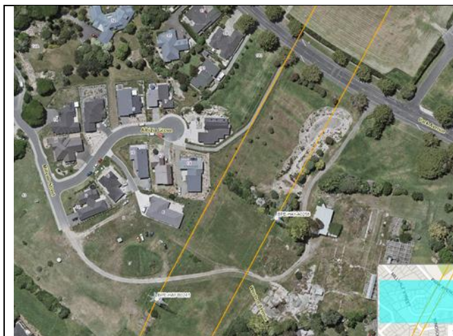
Transpower Asset Map Image of National Grid

The new open space reserve area is centrally located, without direct access to Park Avenue. The BPE-HAY A transmission line crosses over the site, with a transmission tower just to the south of the new reserve area. On the Transpower map image only the centre line of the Transmission Line is shown (in yellow) – there will be conductors on both sides of the identified centre line.