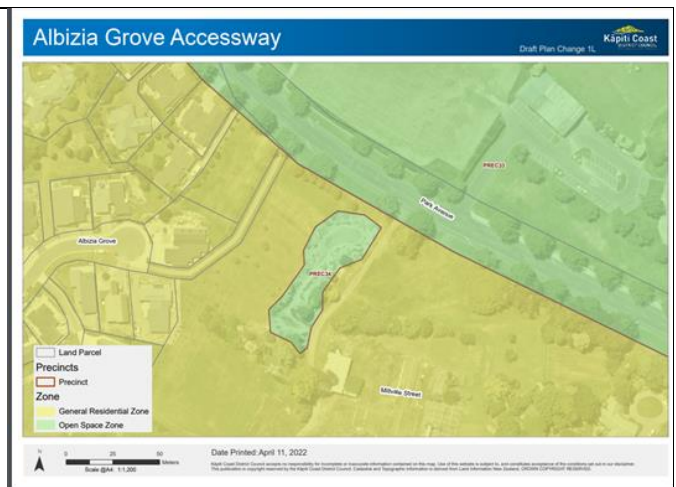
Kāpiti Coast Kāpiti Coast draft Plan Change Albizia Grove