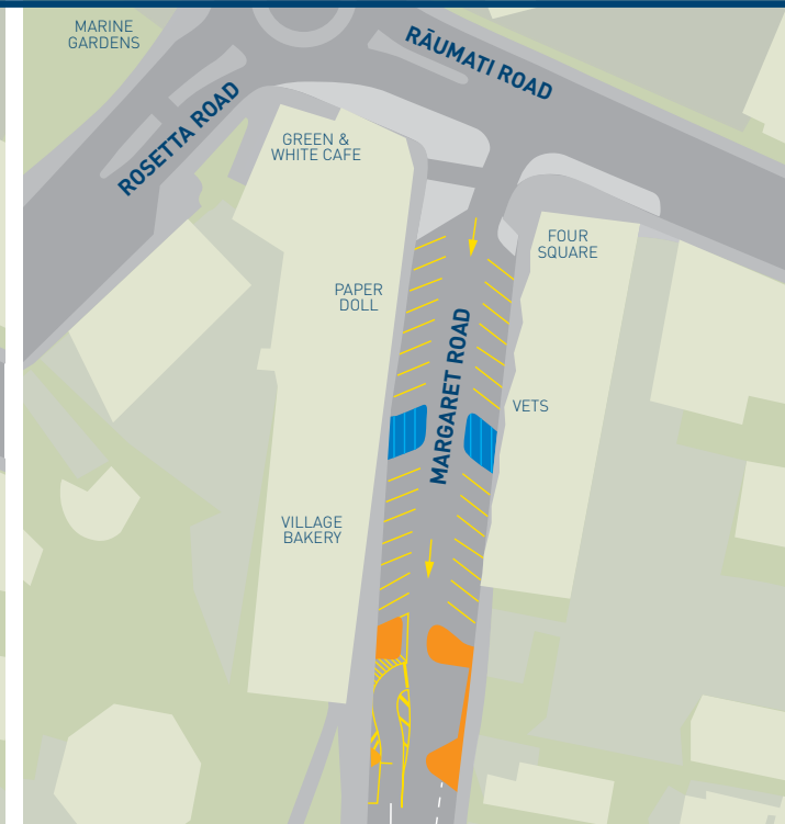
FIGURE 2: Margaret Road becomes one-way.