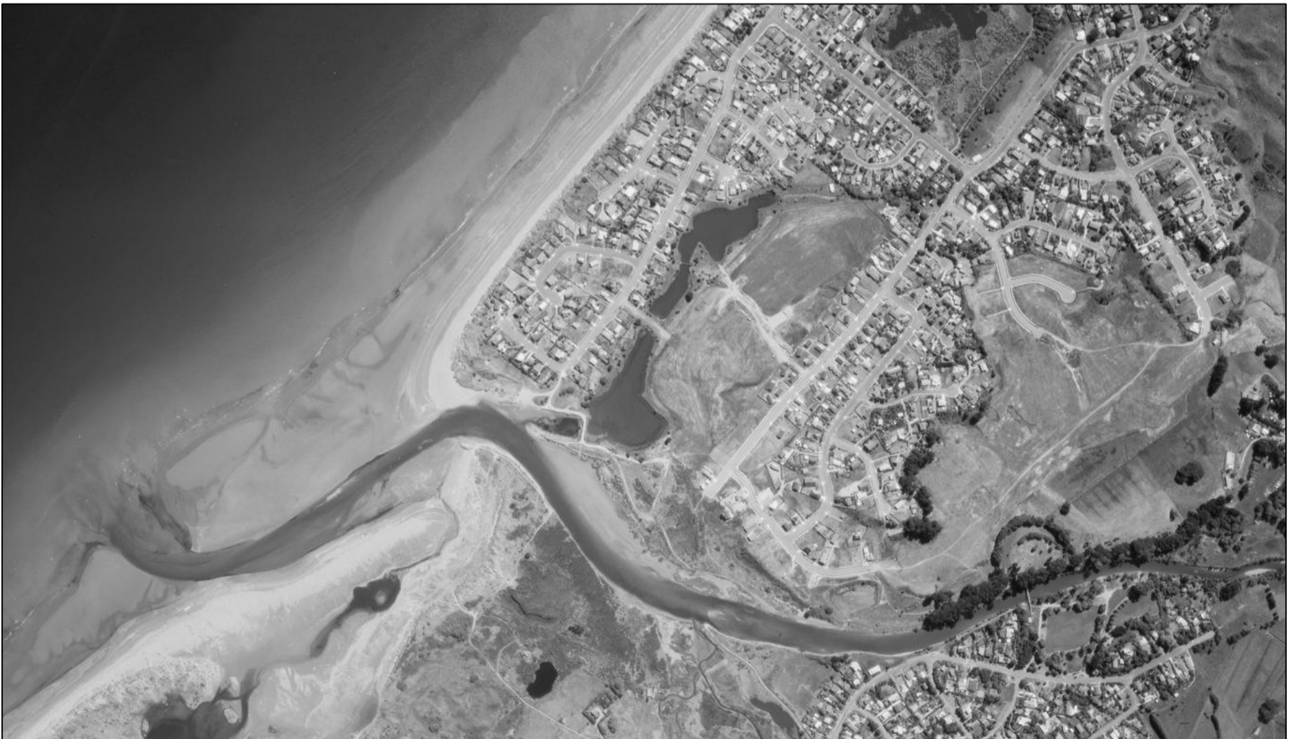
Historical aerial image of Kārewarewa site and surrounding area, 1991.