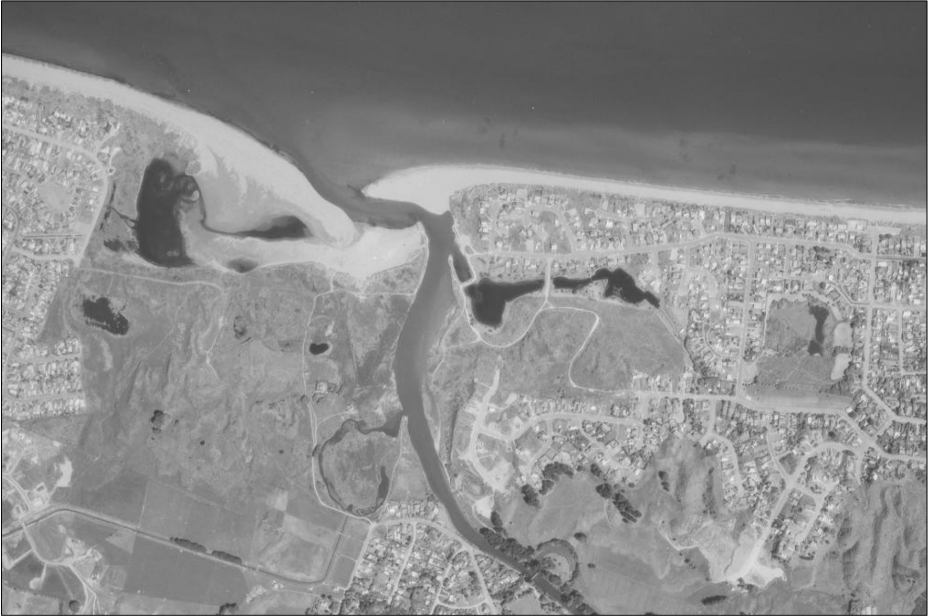
Historical aerial image of Kārewarewa site and surrounding area, 1987.