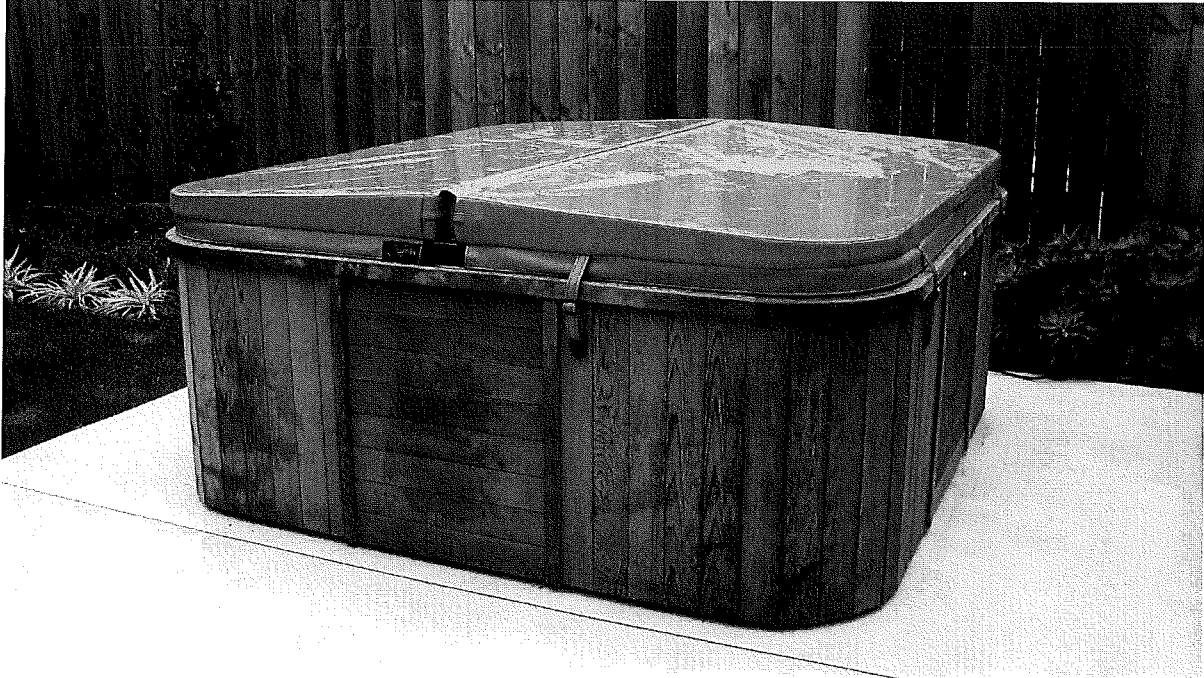
Portable Spa Pool – 760mm above ground level.