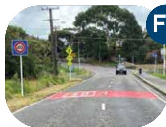
Flush Threshold treatment, e.g., 30/50