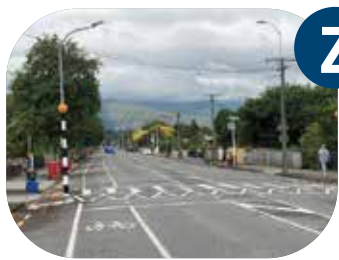
Reconstruct existing Zebra Crossing on Raised Safety Platform