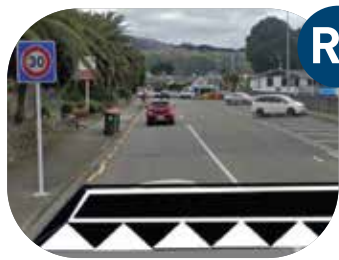
Raised Threshold Treatment