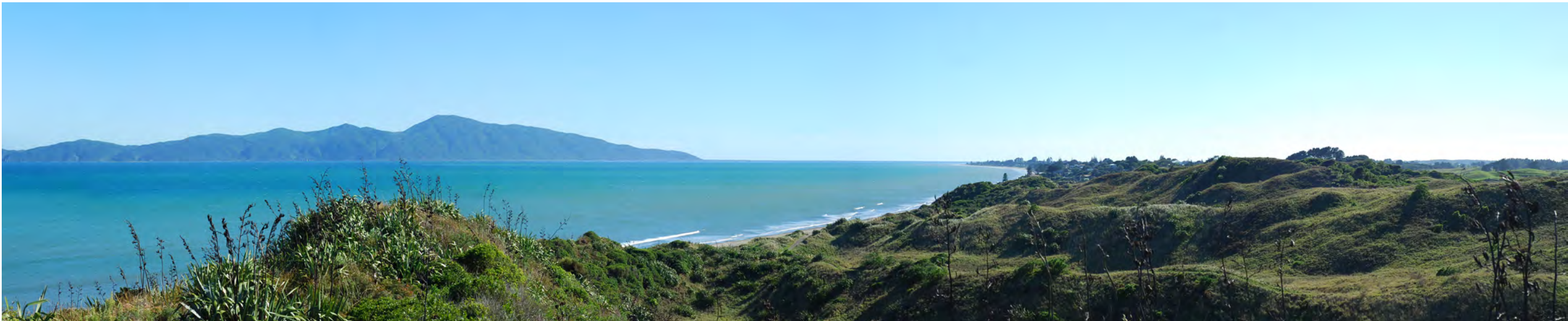
Photograph 10- Coastal dominance area., QE Park