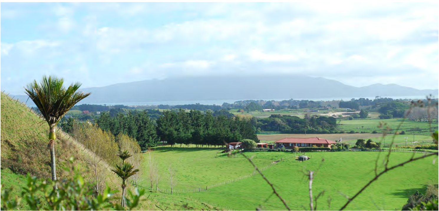
Photograph 4 - view from Kebble Rd, sand quarry in mid ground