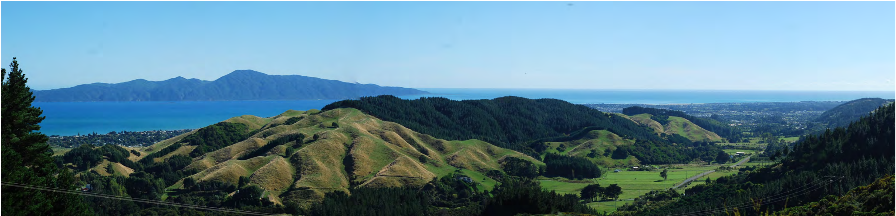
Photograph 1 - view from Maungakotukutuku Road saddle towards Mataihuka