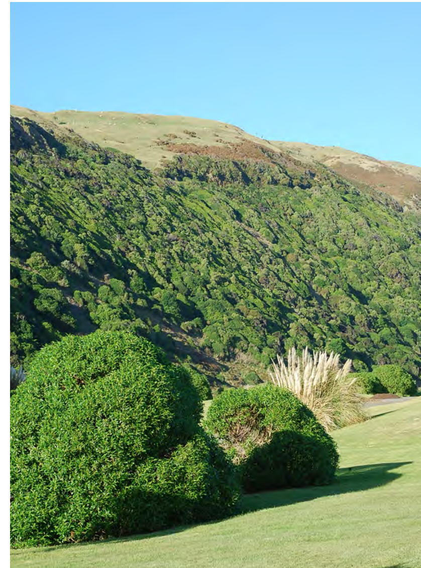
Photograph 7 - view from Amose St Park, vegetation on escarpment