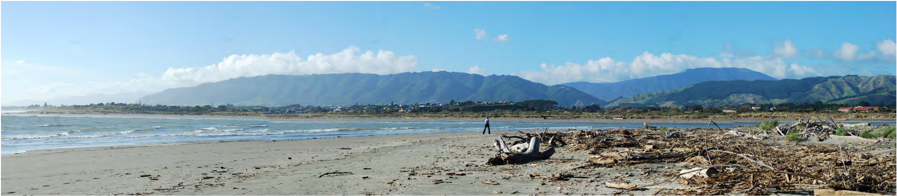
Photograph 5 - view of Hemi Matenga and Otaihanga escarpment from Waikanae River mouth