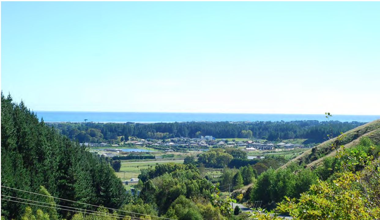
Photograph 3 - view from Nikau Palm Rd