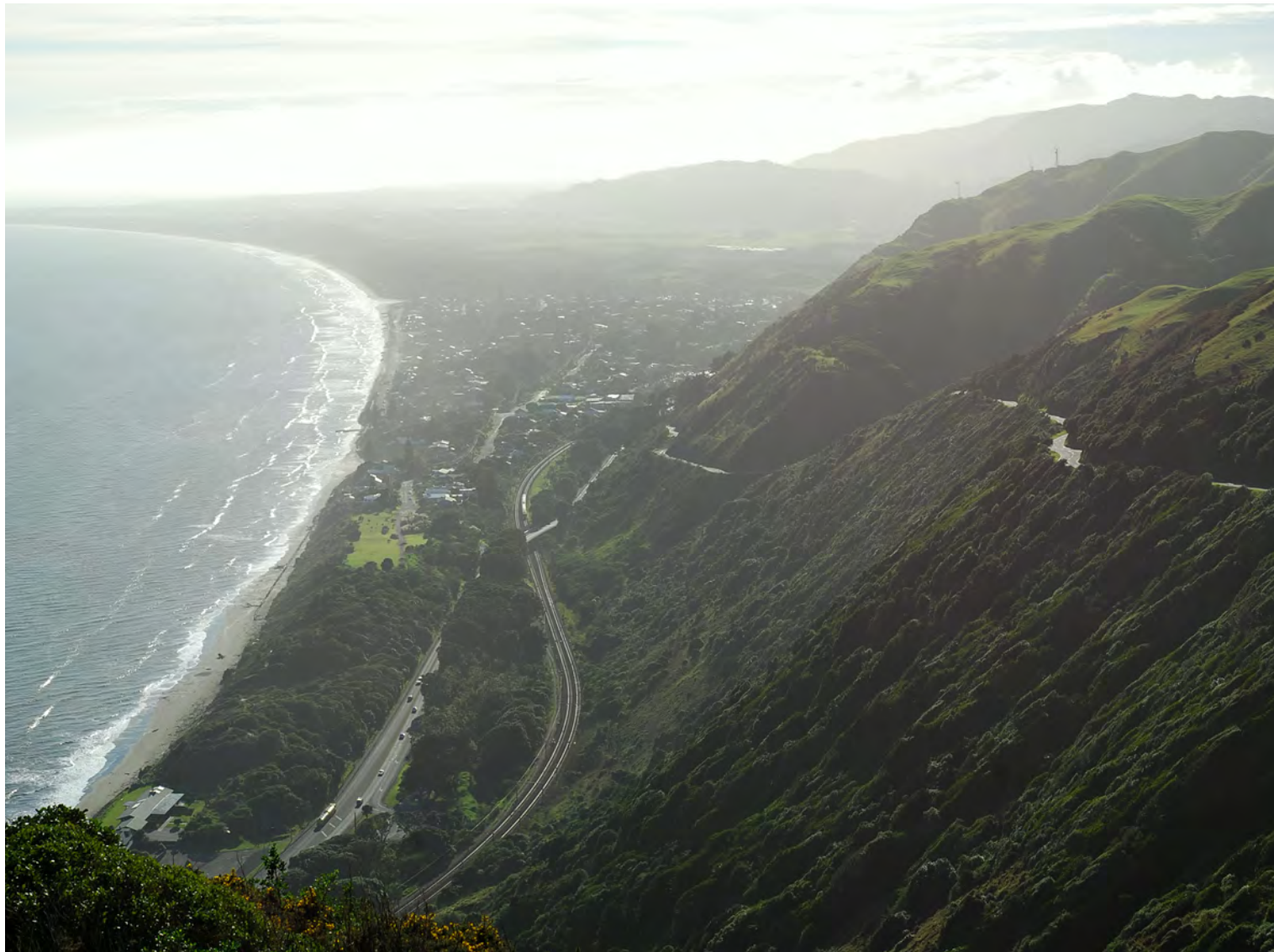
Photograph 6 - view from Paekakariki escarpment