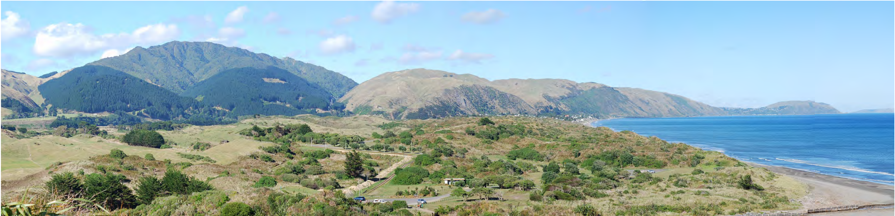
Photograph 2 - view from Trig Point QE Park looking south