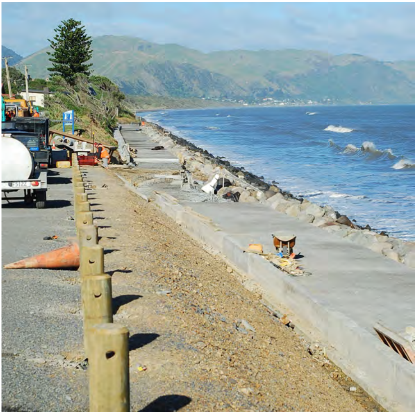
Photograph 8- Coastal dominance area., Raumati Beach