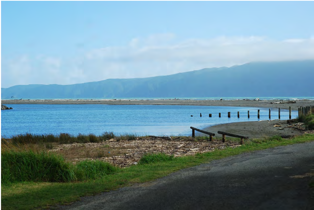
Photograph 9- Coastal dominance area., Waikanae River Mouth