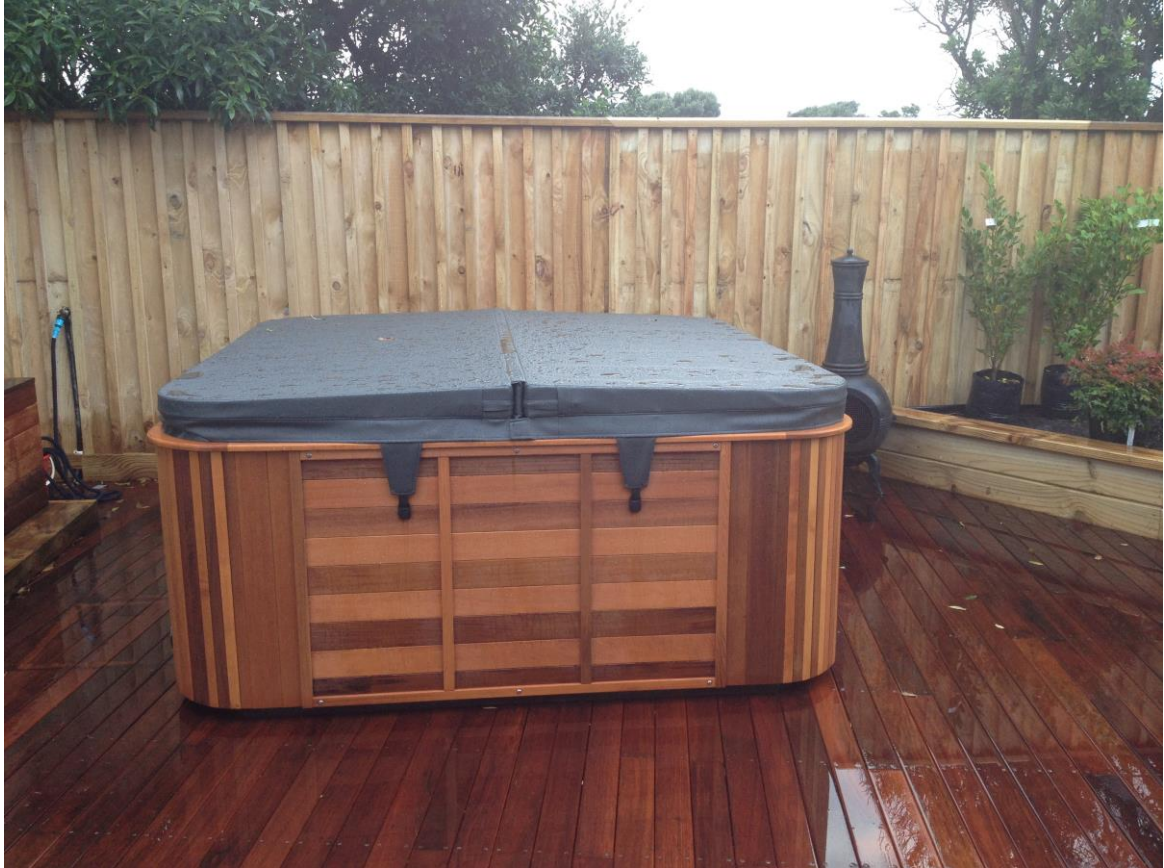
The top of the spa pool is 900mm above the ground.