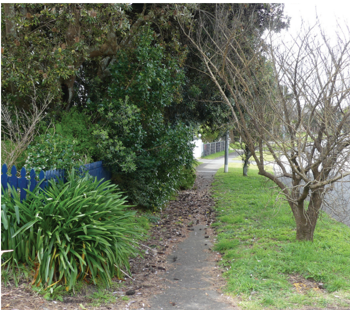
Overgrown planting on a berm growing over the clear zone boundary.

You can also visit us at one of our service centres.