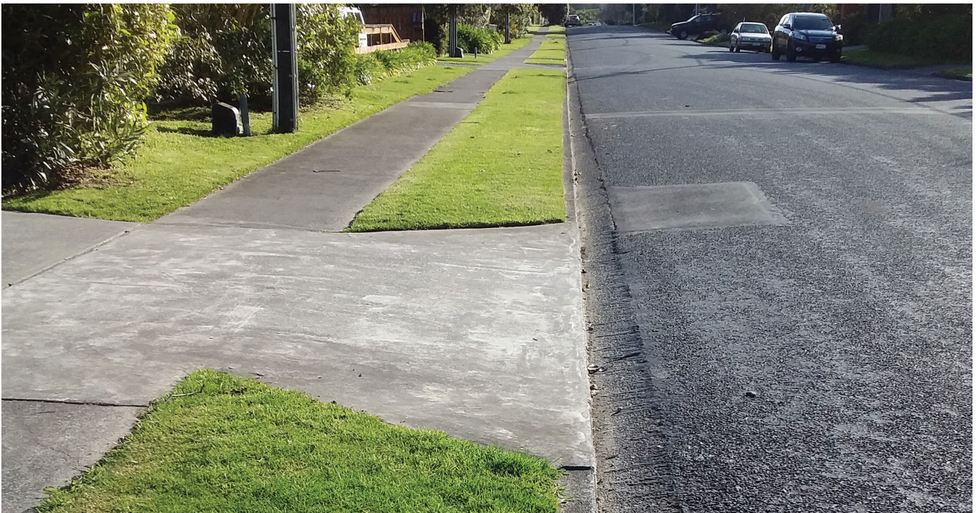
Well maintained berms

Council also maintains some specific areas like road reserves where there is no property frontage.