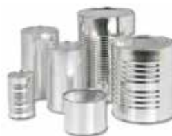
Tins & cans

Contact your local council for more information about which types can be accepted