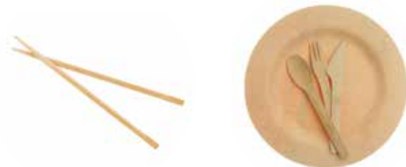
Soft/thin bamboo materials & cutlery