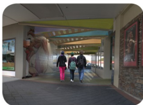
Artist's impressions of possible laneway improvements.