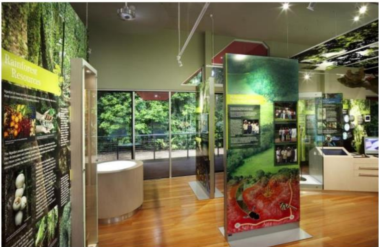
IMAGE 2 INTERPRETATIVE DISPLAY INSIDE MALANDA FALLS

The rebuilt Malanda Falls Visitor Centre and its award-winning modern building reflect the area's geological formations, and the connection to country, as seen through the eyes of the local Ndongji tribe. The Centre is also an environmental education centre, with interpretive interactive displays on the cultural and natural history of the unique Tablelands volcanic region and its wildlife.