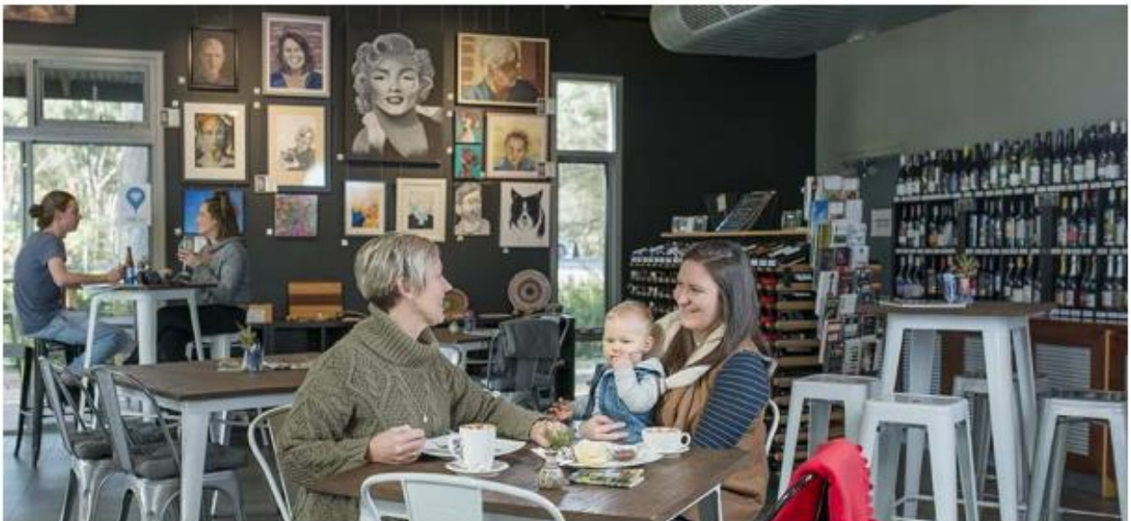
IMAGE 4 INTERIOR OF CLARE VALLEY FOOD, WINE AND TOURISM CENTRE

The Kāpiti facility could hold similar community events in the space. This would bring that positive vibe and community hub feeling to the space that people are looking for. This would foster a sense of ownership among the community.