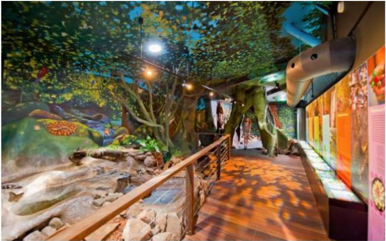
IMAGE 3 LISMORE VISITOR CENTRE, NSW AUSTRALIA

Over a seven year period the Lismore Visitor Centre has been transformed from an information point to an attraction in its own right. Over 16 interpretative panels tell the stories of Lismore's history, Aboriginal culture and unique natural environment. Lightboxes in each panel link the content to local attractions, events and tours to encourage visitors to explore and immerse themselves in the region.