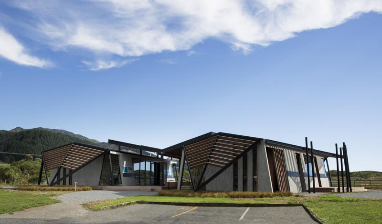
IMAGE 5 RAMAROA HERITAGE CENTRE

The building has both indoor and outdoor spaces that highlight the natural environment on which it sits. It was built for a cost of $1.6M. The building includes artwork from a local Māori carver, and it has been built using timber battens and the layout and look has been created to make a strong connection to a traditional pā site.