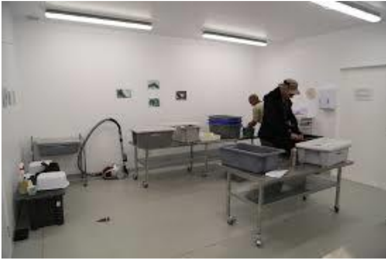
Figure 4. BIOSECURITY FACILITY FOR ACCESS TO LITTLE BARRIER ISLAND

Like Kāpiti, in order to access this island, you must travel with an authorised vessel and you need a permit. However, it is only open on the weekends, access to areas on the island are strictly managed and limited to one area, and up five tracks. In order to protect this island, visitor numbers are limited to 20 a day.