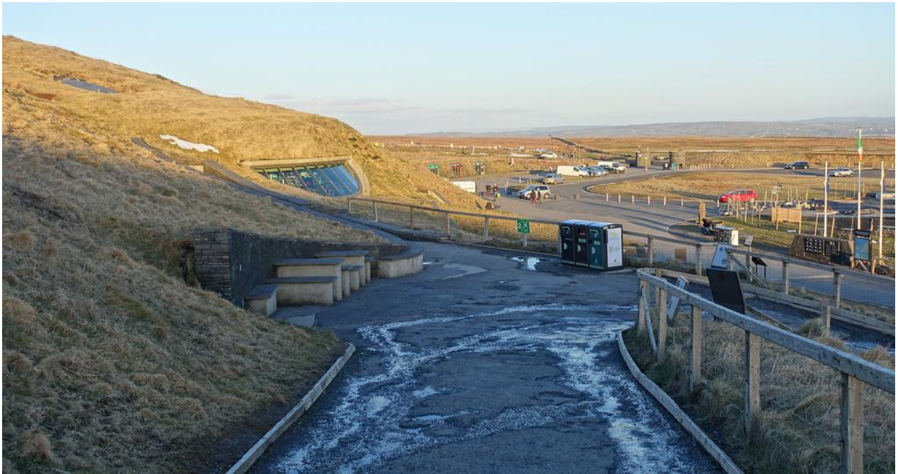
IMAGE 1 CLIFFS OF MOHER VISITOR EXPERIENCE CENTRE