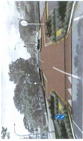
EXAMPLE OF RAISED JUNCTION