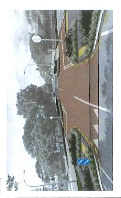
EXAMPLE OF RAISED JUNCTION