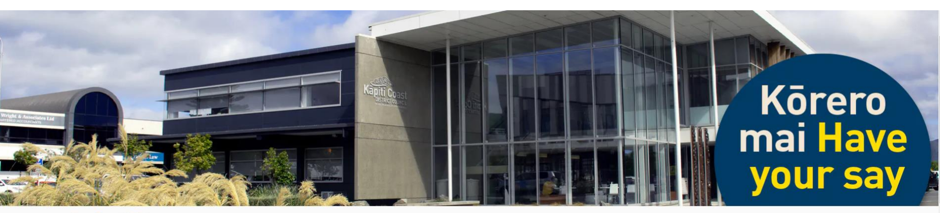
Home » Representation Review

Received some responses to the survey posted on "Kōrero mai – Have your say"