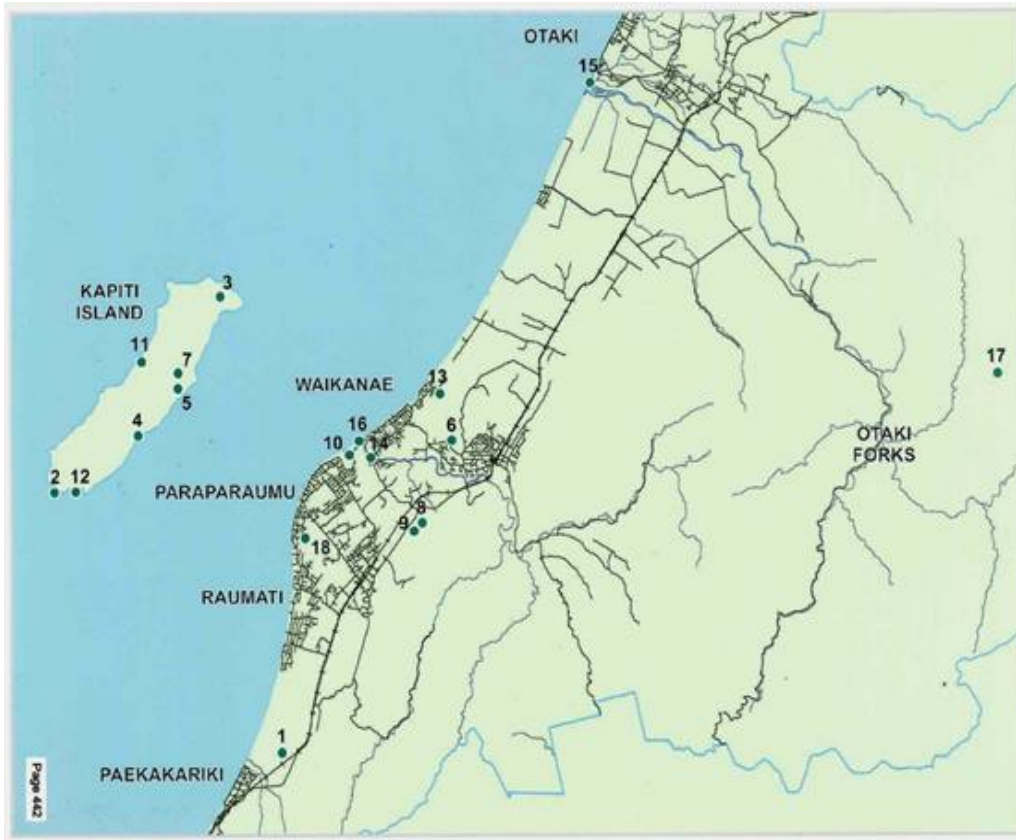
Figure 3.1: Rare and Threatened Vegetation Species