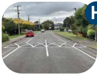
Construct Hump/ platform (H)