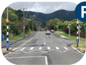
Dual cycle/ pedestrian crossing (P) on raised platform