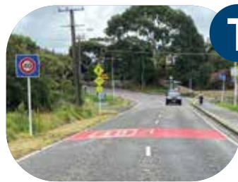
New Threshold treatment (T), e.g., 30/50