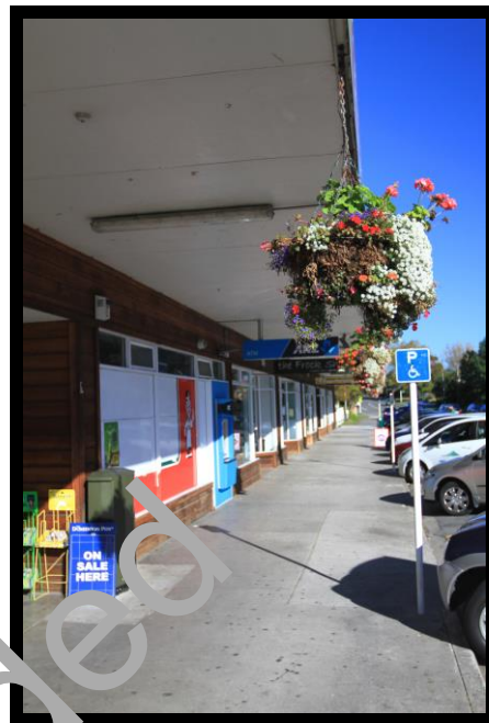
Active frontage and simple landscaping can delineate ownership and instil sense of place