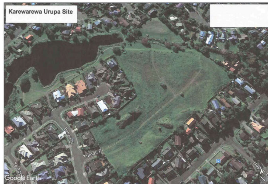
Figure 2: The undeveloped part of Kārewarewa urupā