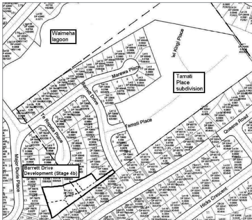
Map 3: Residential and undeveloped areas of the urupā block