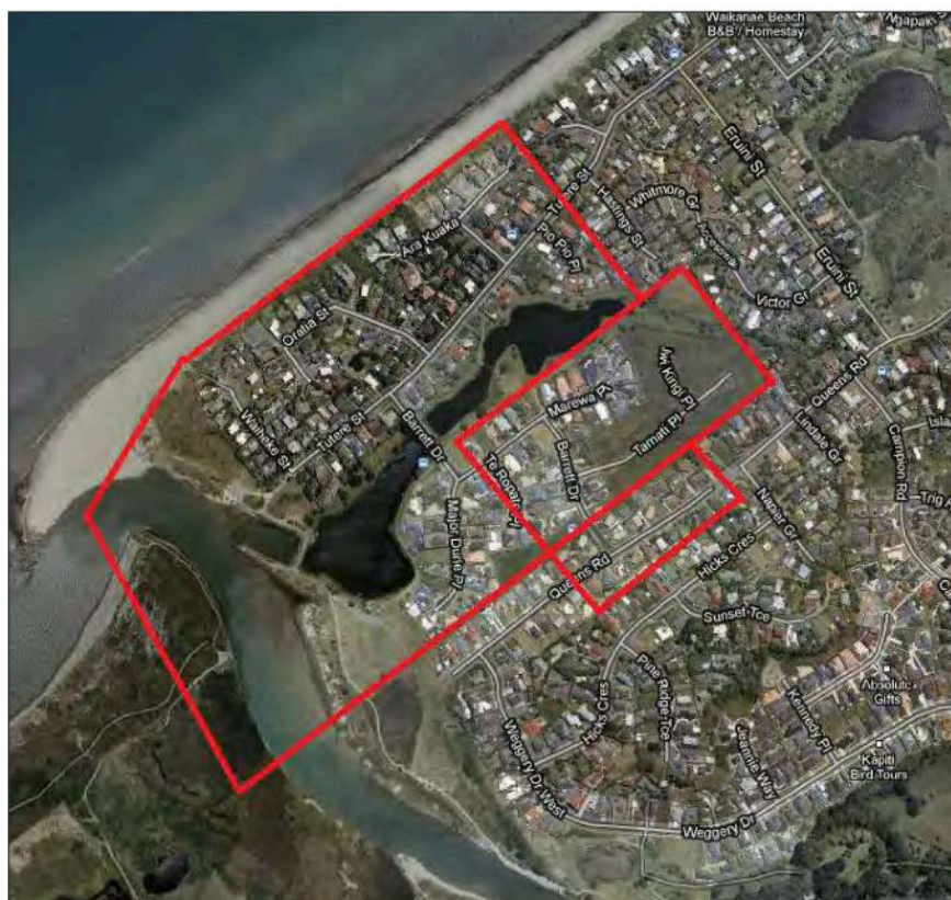
Map 2: The Waikanae Land Company's original lands, including the urupā block

Division of Internal Affairs was among those concerned about the proposed commercial development of the estuary, and the effect it would have on the native bird population. 55 The company owned about 100 acres on the northern side of the river (see map 2), where it bulldozed the sandhills for residential sections and also began dredging the Waimeha wetlands (the old stream bed). By the end of 1971, a special dredge had 'moved 350,000 cubic metres of sand and created the new Waimanu Lagoon.' 56 This dredged material was compacted and re-deposited on top of the urupā. 57